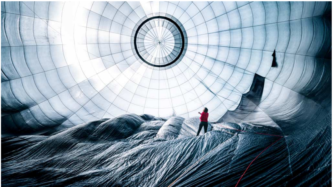
Aerocene, test flight at Maintenon, May 2023.