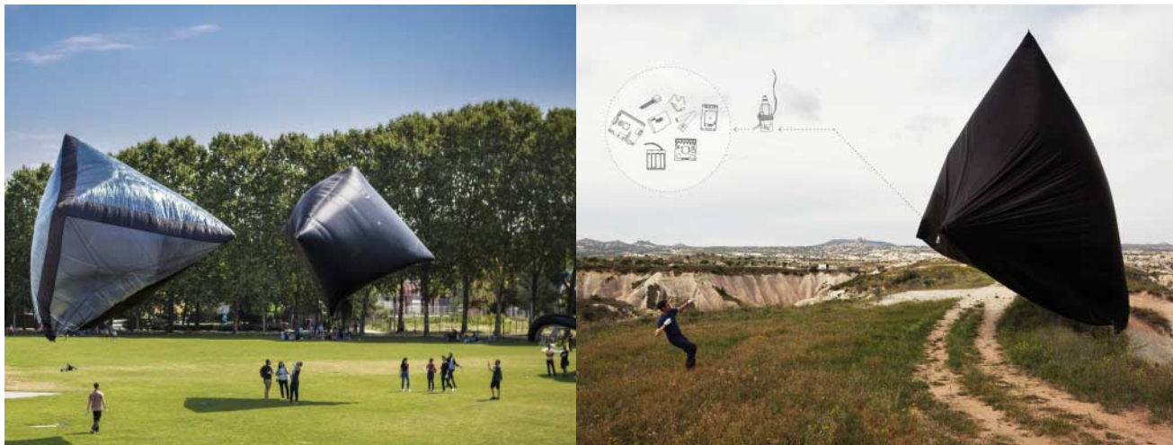
Aerocene au Fab City Summit, Parc de La Villette, 2018

Using the Aerocene Backpack, the Aerocene community has launched numerous aerosolar sculptures lifted only by the sun and the air, carried only by the wind. Through the Aerocene app, connect with the Aerocene community to join a real flight or engage with the over 103 tethered, 16 free and 8 human Aerocene flights that have floated in more than 43 different countries. The App's new Augmented Reality functionality invites us to live an immersive experience by visualizing the invisible drawing made by an aéro