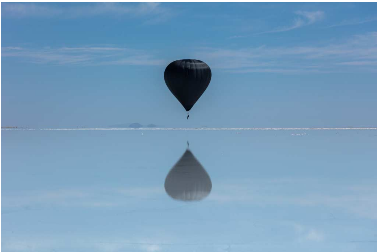
Aerocene Pacha, Salinas Grandes de Jujuy, Argentina, 25 January 2020.

Floating sculptures, music, conversations, children's workshops and an exhibition... Aerocene presents a fun and educational day geared towards sustainable, fossil fuel-free futures.